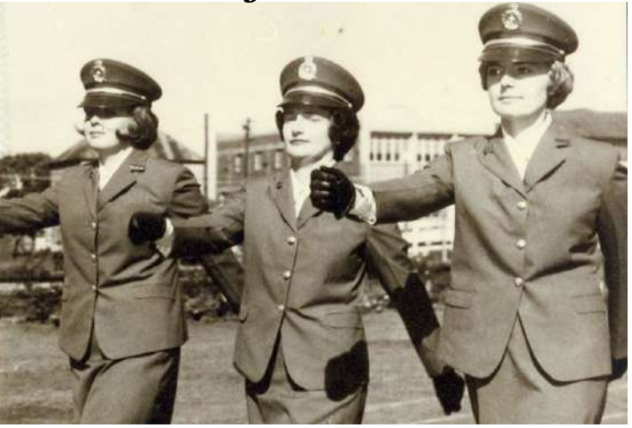
(continued in January Newsletter)

'I'm evidence, you can come up through the ranks'