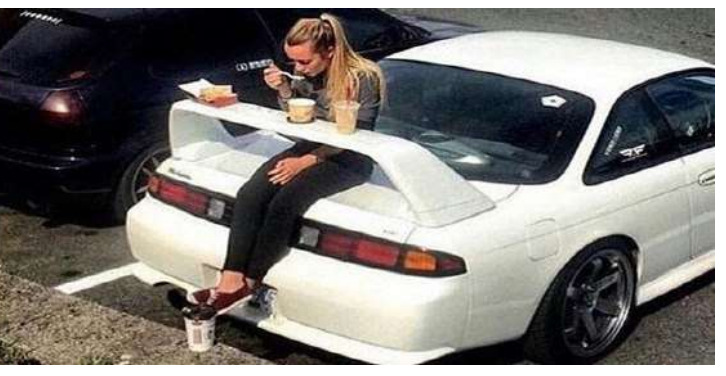
Finally I understand why cars have these things...

"Thought she was having her photo taken."