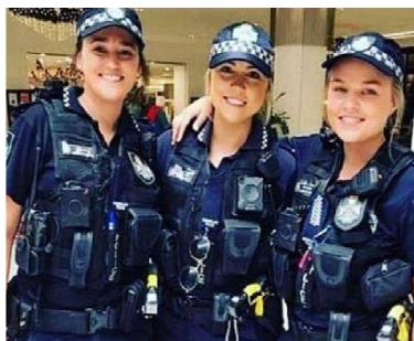
Today's recruits (weighted down)