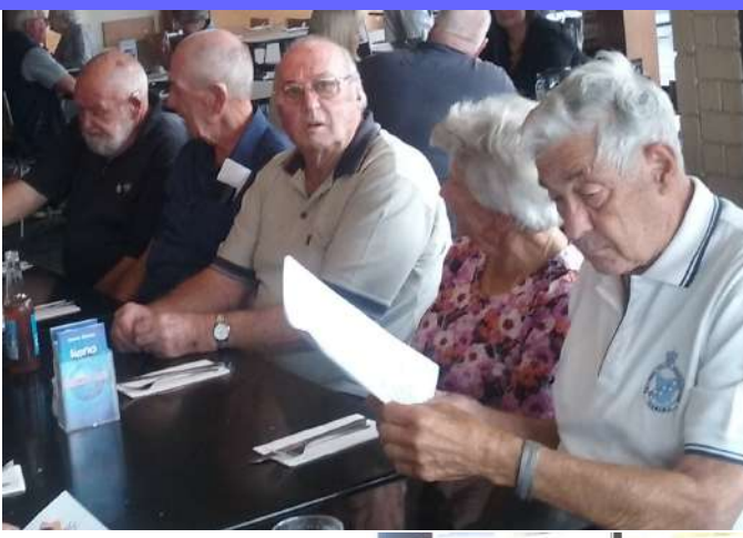
The Northern Branch meets regularly at the Riverside Motor Inn on the first Wednesday of the month (12 noon).

Social meetings are held each Friday at 4pm at the Plough Inn, Brisbane Street, Launceston